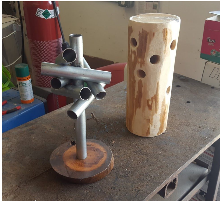
Table top examples of Secwepemc Landmarks displaying the functionality on the concept. Left, an example of what is used in Switzerland, Right, an example of a stylized version which enhances available space for pictograms and storytelling.