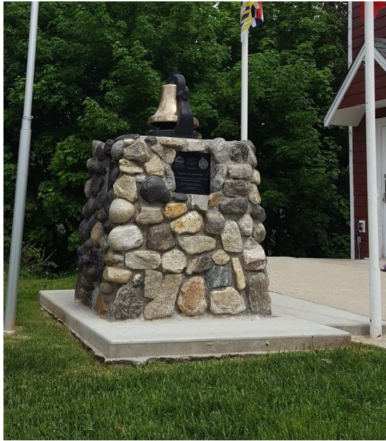
Monument @ Chase Museum